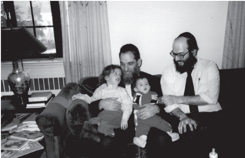
With his father and his children