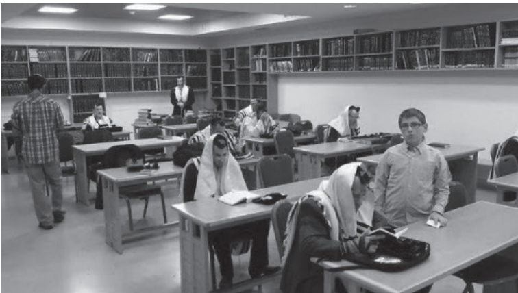
The shul where the attack took place. The right seat of the third bench from the rear, on the left side, was Rav Twersky's makom kavu'ah.

The reports began to filter through. A pall of intense, suffocating sadness gripped the Jewish world. The unthinkable had