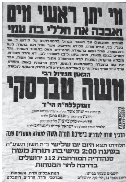
Bitter news, levayah poster