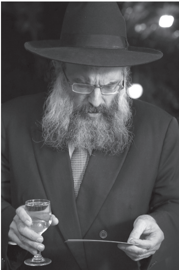
Reciting a berachah under the chuppah of a talmid