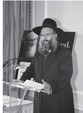
Delivering the keynote address at the 2011 Yeshivas Toras Moshe annual dinner