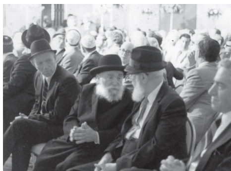
Rav Moshe Feinstein and Rav Yosef Dov Soloveitchik