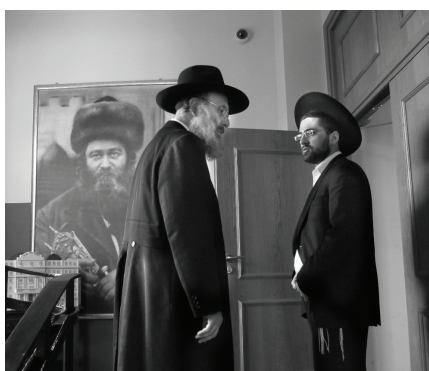
Inside the building of Yeshivas Chachmei Lublin, next to a portrait of Rav Meir Shapiro, founder of the Daf Yomi Movement