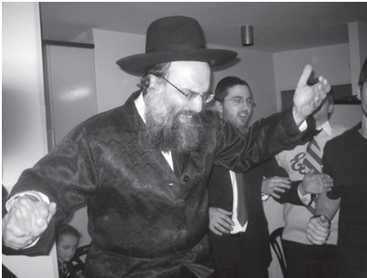
Experiencing the special elation of Purim