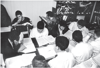
Delivering shiur in the fourth-floor otzar sefarim of the Yeshivas Novhardok building, where Toras Moshe was formerly located

It was Tammuz, nearing the final stretch of the thirteen-week-long summer zman. I was sitting in the room where we