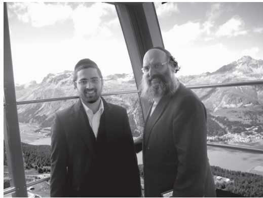
On a cable car in Switzerland