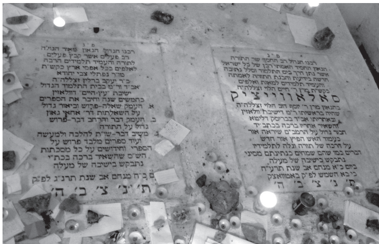
The kevarim of the Netziv and Rav Chaim Brisker, side by side

Eventually, he visited Reb Chaim's kever on three different occasions. Each time, he would learn Chiddushei Rabbeinu Chaim HaLevi as a preparation for the occasion.