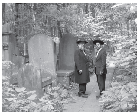
In the Jewish cemetery of Warsaw