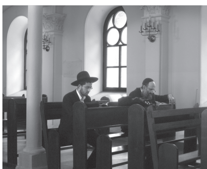
Learning in the Nozyk Shul — the only shul in Warsaw that was not destroyed during the Holocaust