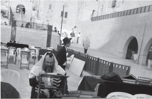
Wrapped in his tallis, crowned with tefillin, and immersed in tefillah at the Kosel

In other words, the full completeness of a mitzvah is achieved when performance is combined with reciting the pesukim that delineate that mitzvah. 6 So, his whole life, Rabi