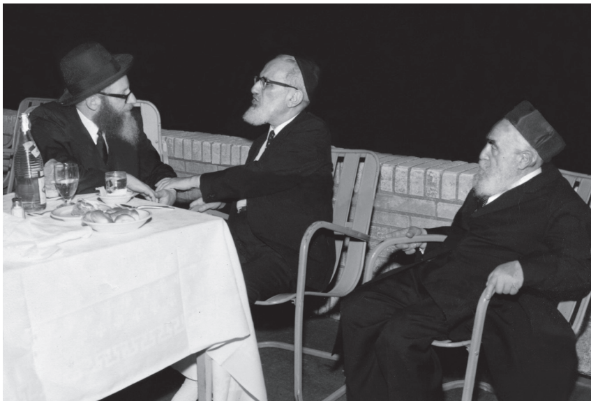
R-L: Rav Moshe Feinstein, Rav Yosef Dov Soloveitchik, Rav Shneur Kotler

In addition to his own Torah thoughts, Rav Soloveitchik would regularly discuss Torah insights of his grandfather Reb Chaim and his father Reb Moshe. The innumerable anecdotes