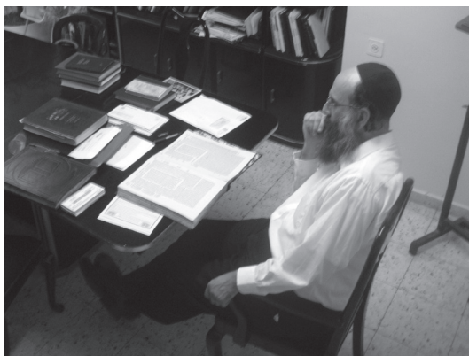
Learning at his dining-room table, deep in the sugya