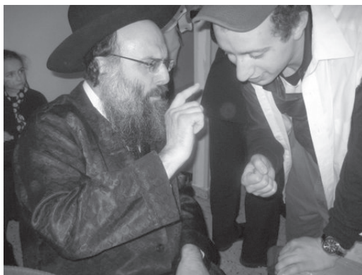
Giving a berachah to a talmid on Purim