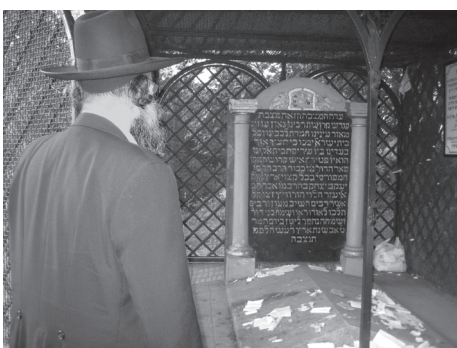
At the kever of the Chozeh Mi'Lublin