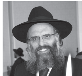
Rav Moshe Twersky

behalf of Klal Yisrael as a whole. Although even they cannot imagine the pain and trauma of the Twersky family, talmidim of Rav Twersky acutely felt the tragic and violent loss of their beloved, awe-inspiring Rebbe. It was terribly difficult to absorb the fact that he was gone.