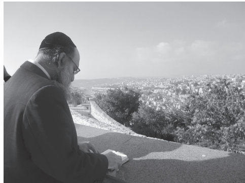
At Har HaTzofim on Chol HaMoed, gazing down on Har HaBayis