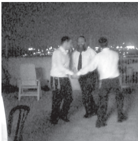
Having a private Simchas Beis HaShoeivah dance with his son and son-in-law