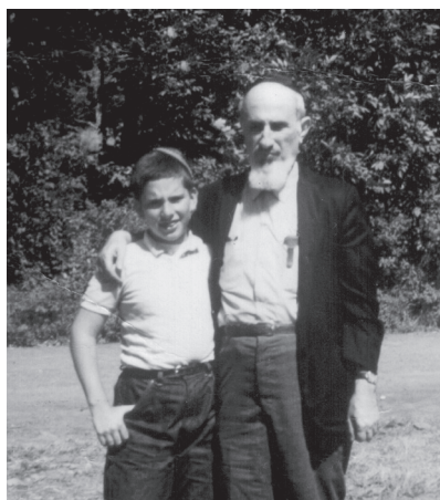
As a young boy, with his grandfather, Rav Yosef Dov Soloveitchik

For Rav Soloveitchik, it was love at first sight with his first grandchild, and those feelings