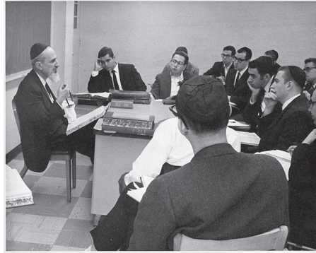
Rav Soloveitchik delivering a shiur