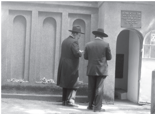
At the ohel of the Vilna Gaon

I saw in one of the contemporary anthologies of halachah the following question. If a non-Jew coerces a Jew to transgress at the threat of death; the halachah is that, if it is in the presence